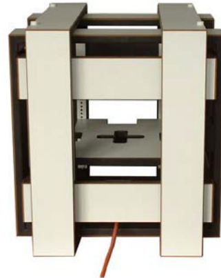
Triaxial Helmholtz coil MGA_HCST_50-28