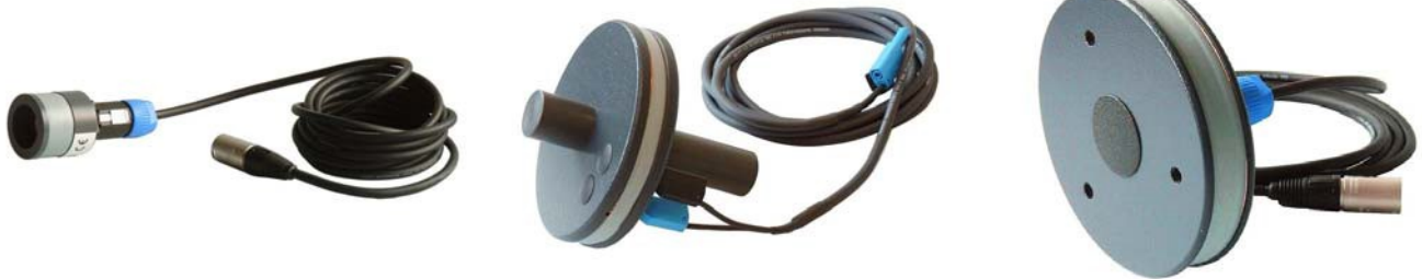
Loop Sensor MGA_LS040

For immunity tests radiating loops are necessary to generate magnetic fields. Suitable loops are available. Measuring emissions require loop sensors which can also be ordered from our company