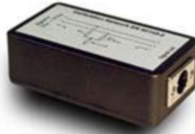
Calibration network MGA_B2 according to Fig. B.2 (EN 55103-2)