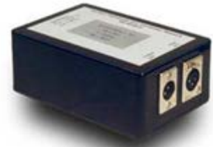
Current transducer incl. correction network MGA_B4 according to Fig. B.4 (EN 55103-2)