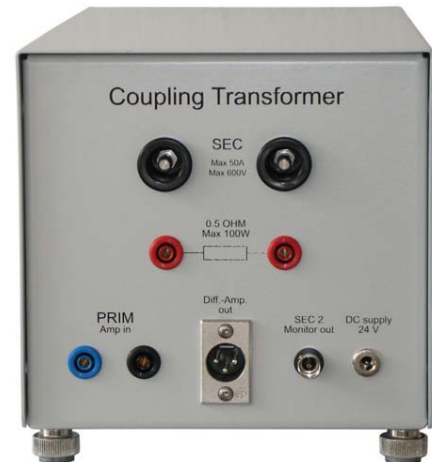
Coupling transformer MGA_CT2.5-50AC with differential amplifier

MIL-STD-461E CS 101 requires a coupling transformer for conducted susceptibility tests. Our company has developed a coupling transformer which meets all requirements. Due to direct coupling to voltage mains, the coupling transformer has an additional differential amplifier for common mode rejection of the AC mains. Using the coupling transformer without this amplifier can destroy any measurement instrument due to overvoltage.