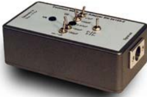
Common mode test adapter MGA_B1 according to Fig. B.1 (EN 55103-2)

EN 55103-2 requires certain immunity tests for frequencies from 50 Hz to 10 kHz. The following test equipment fulfills all requirements according to EN 55103-2, annex B